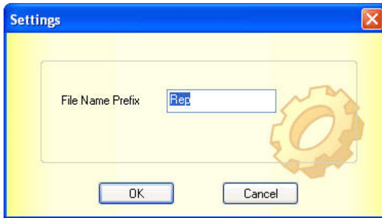
Figure 4.5: Define Repaired File Setting