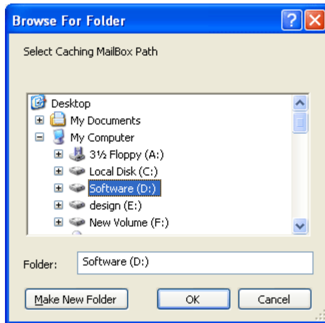
Figure 5.5: “Browse for Folder” Window