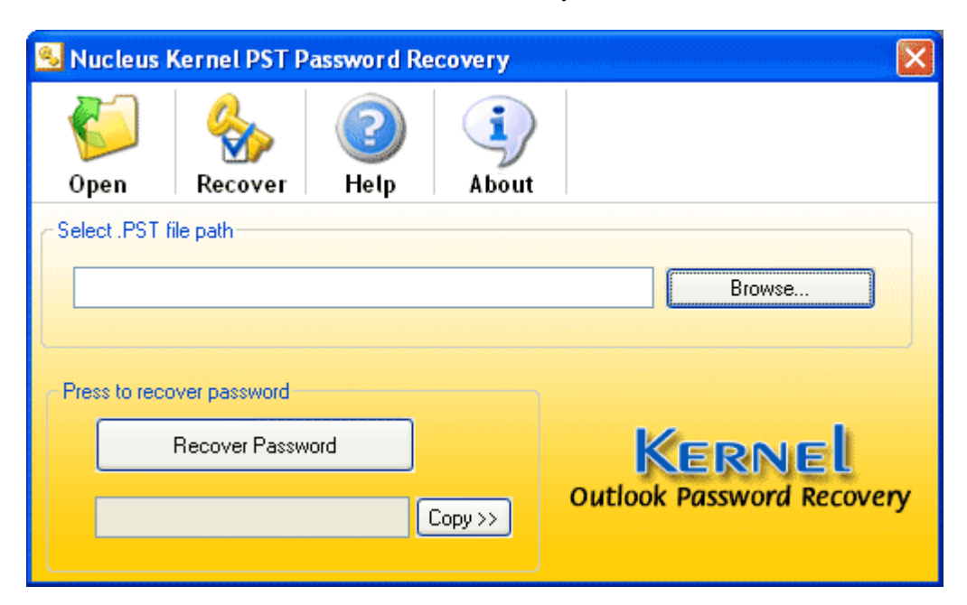
Figure 4.1: Main Window: Kernel for Outlook Password Recovery

1. Launch Kernel for Outlook Password Recovery