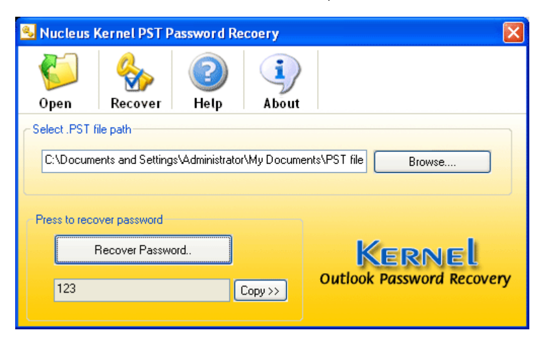
Figure 4.3: Recover Password

4. Click the Recover Password button to recover password